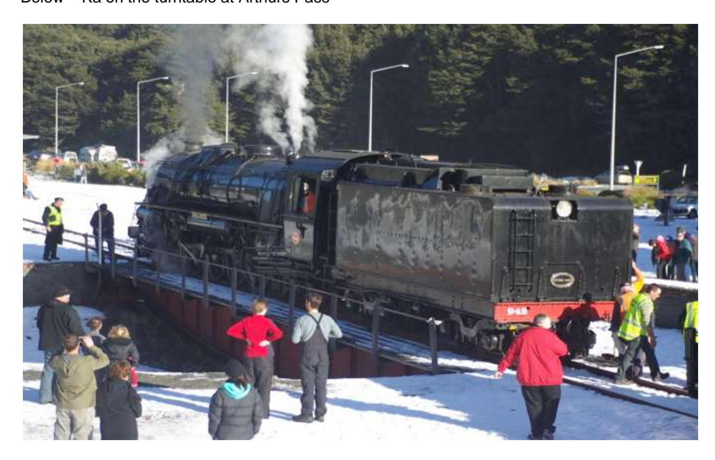
Below - Ka on the turntable at Arthurs Pass