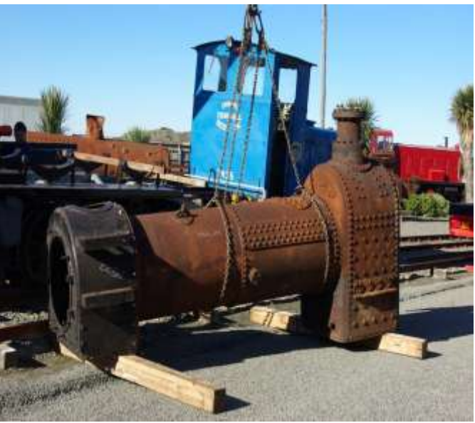
B10s boiler arrives in Oamaru from Christchurch. Unloaded from the truck ready to be turned.