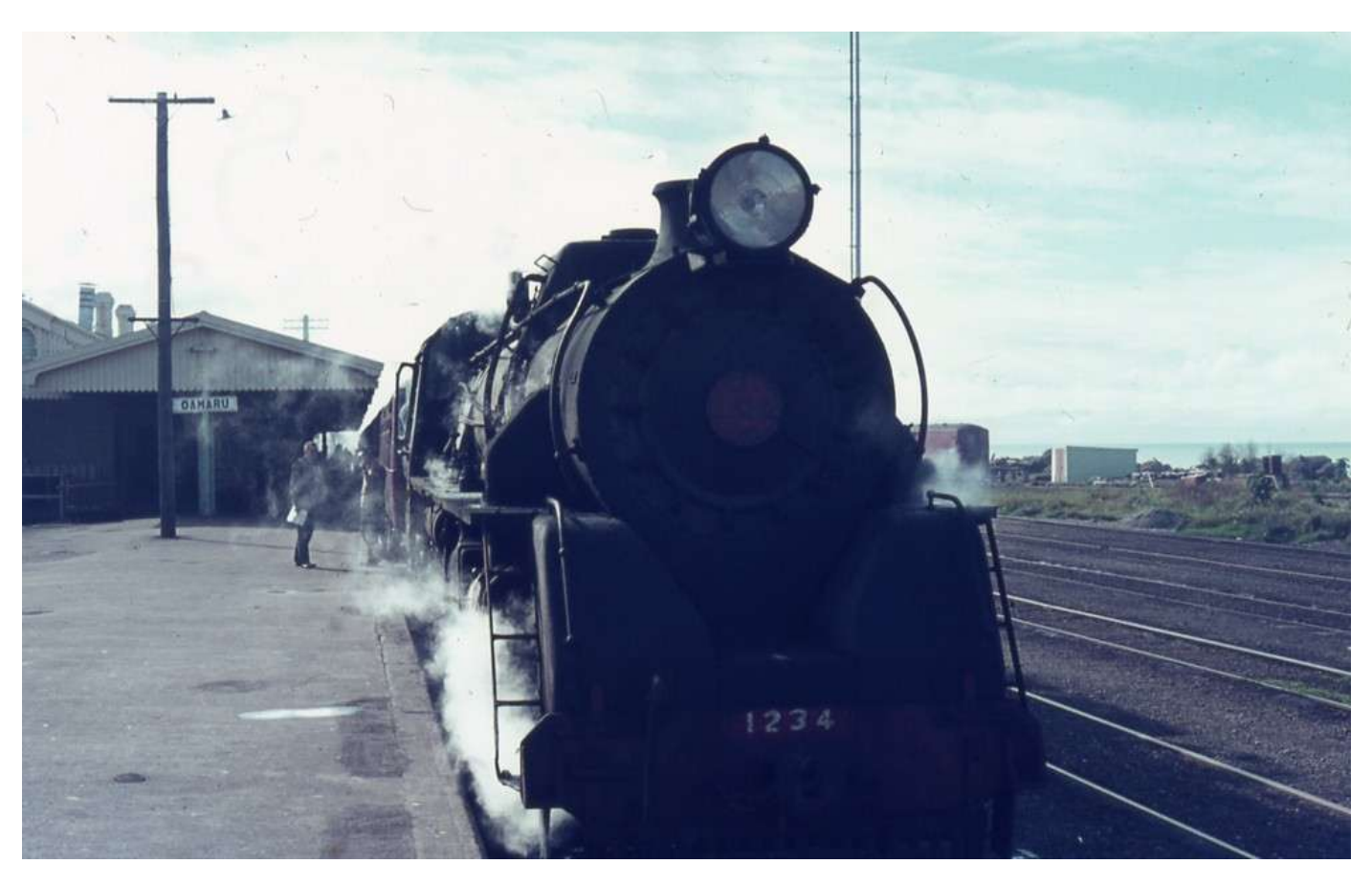
J 1234 on No 143 Christchurch – Invercargill Express at Oamaru Station 1979–Arthur De Maine