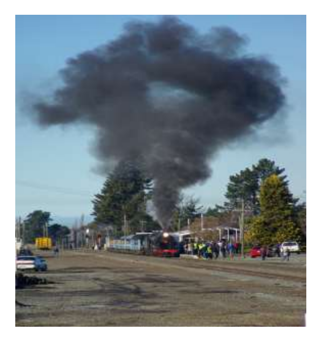
Left - Ka 942 at Springfield.