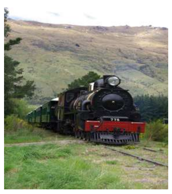
The Flyer heading into Kingston

It is hoped to produce this newsletter twice a year at least but to be able to do that we need some input from members. Therefore if you would like to contribute with a written item or photographs please contact me. This newsletter will go out via e-mail as a PDF document which means everyone should be able to open the document. There will be a small number of printed copies for those whom are not in the 21<sup>st</sup> Century.