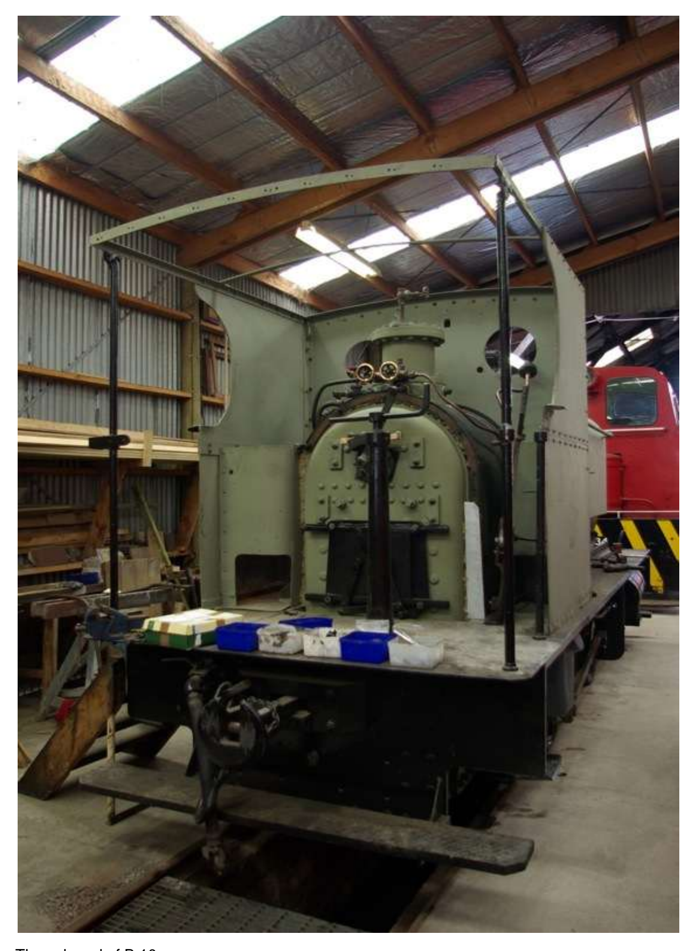
The cab end of B 10.