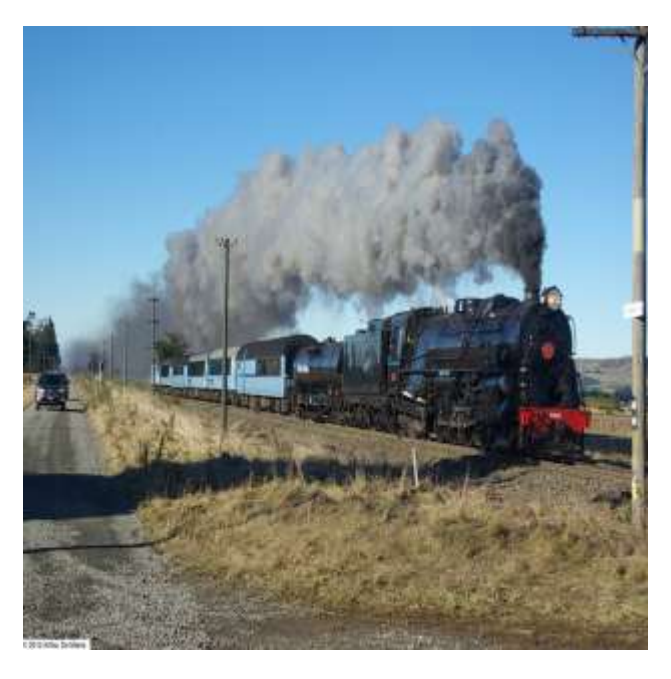
Above – Ka 942 heading up the long straight to Springfield.